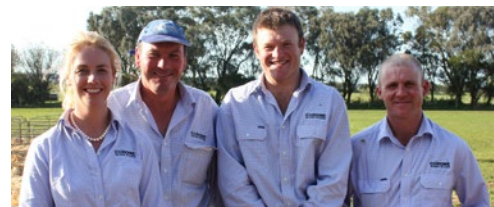
The team at Chrome Sheep Studs would like to thank everybody for their contribution to the success of our October Open Day and Ram Sale.