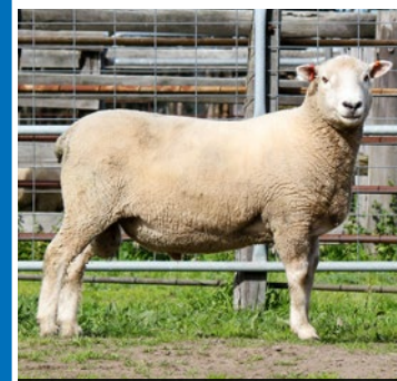
These sires have progeny in this January sale