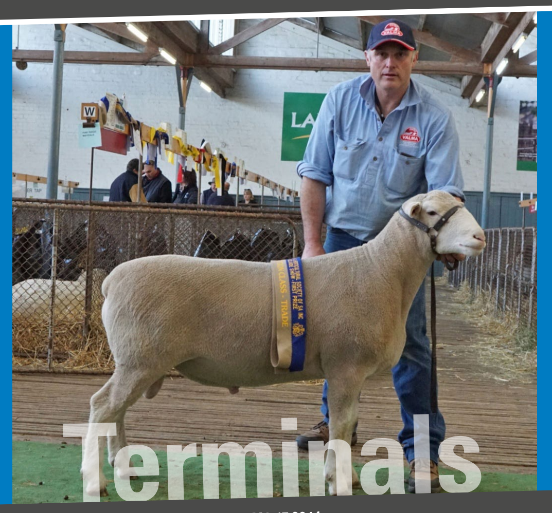
VALMA 17.0044