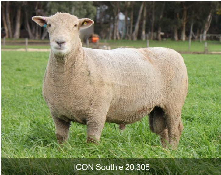
ICON Southie 20.308