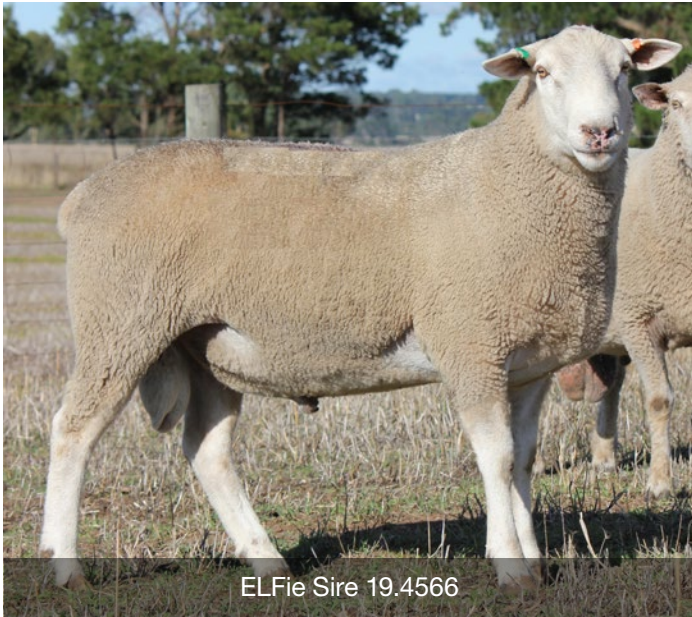
ELFie Sire 19.4566