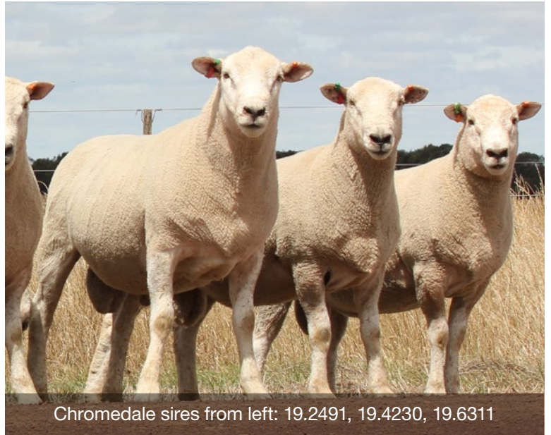
Chromedale sires from left: 19.2491, 19.4230, 19.6311